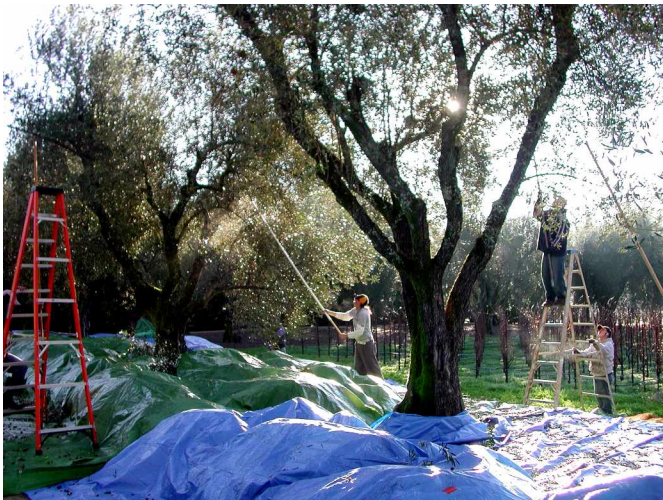
Picking olives January, 2005

A fine and healthful New Year to you in 2005! Here on Spring Mountain, the New Year is bestowing rain, lots of it, always good news, for it recharges the groundwater that serves us in the vineyard. Accumulated winter rainfall sees us through the dry months of May through September when we must judiciously meter out the water that sustains the vines through another growing season.